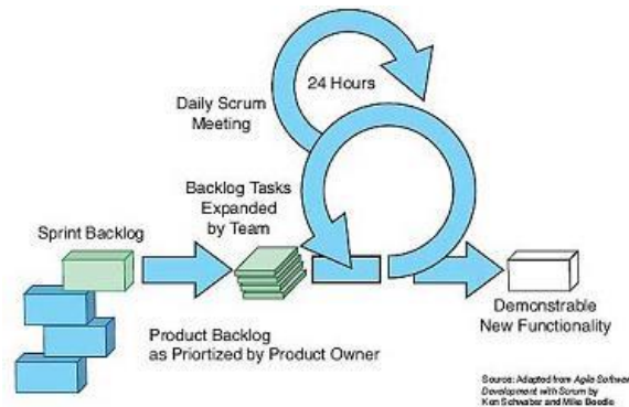
Fig.2: Scrum method flow diagram

Difference 4: Engineering Method XP has 13 core practices that are strictly defined for test differentiation, pair programming, continuous integration, etc. Scrum emphasizes self-organization.